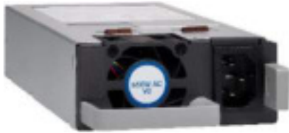
Figure 13. 650W AC power supply