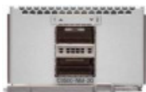
Figure 10. Cisco Catalyst 9500 Series network module 2-port 40 Gigabit Ethernet with QSFP+