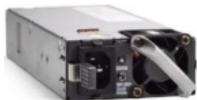
Figure 12. 950W AC power supply

Figures 12 through 14 show the power supplies available for the Cisco Catalyst 9500 Series.