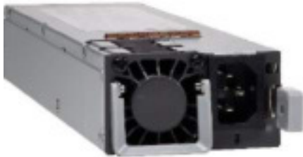
Figure 14. 1600W AC power supply

Tables 7 and 8 provides more details on the Cisco Catalyst 9500 Series power supplies.