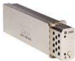
Figure 11. 240G SSD storage

Figures 11 and 12 show some of the available accessories.