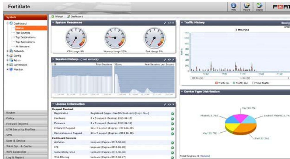
FortiOS Dashboard — Single Pane of Glass Management

Fortinet FortiCare support offerings provide comprehensive global support for all Fortinet products and services. You can rest assured your Fortinet security products are performing optimally and protecting your users, applications, and data around the clock.